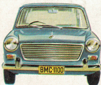
Morris 1100. For the family that is going places. ($1,999, £999/10/0)